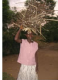
Figure 4: projects supported