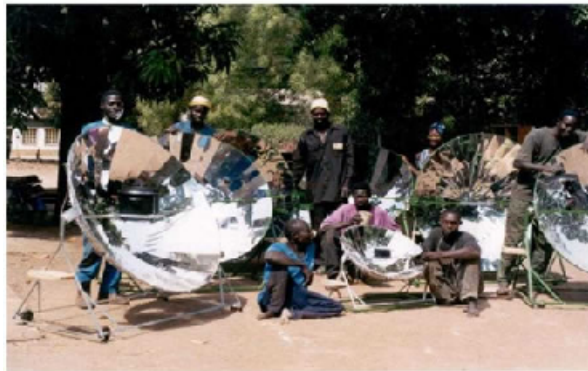
Figure 2. Solar cookers in Tchad