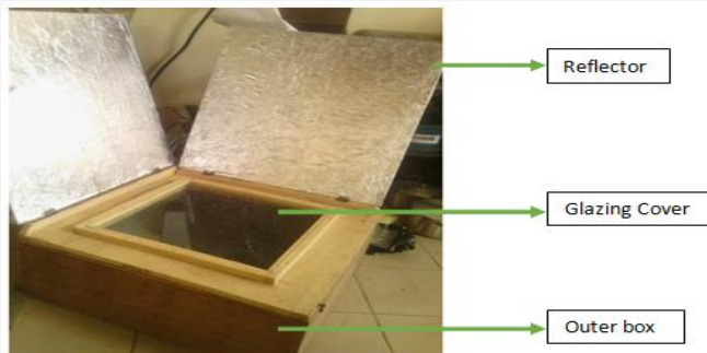
Figure 1: The Constructed Solar Box Cooker

Project Description: A family size solar box cooker capable of cooking for 4 to 5 persons was constructed. The constructed cooker has an aperture area of 0.25m 2 . The constructed solar box cooker is as presented in Figure 1.